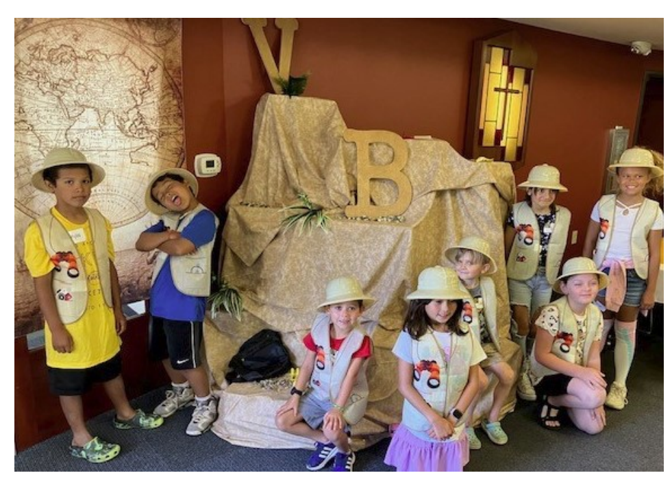
VBS with VBQ in July

This year's Vacation Bible School (VBS) will again be a weekend event scheduled for 20-21 July! Saturday, 20 July, will be a full day of fun learning for children aged Kindergarten through sixth grade. Educational opportunities will be available for adults too. Sunday will continue the activities with worship, final VBS lessons, and the a congregational VBS BBQ, aka VBQ.